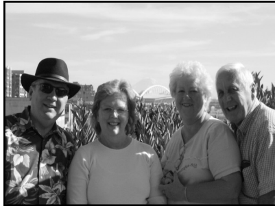
Northwest Grace Conferences 2006